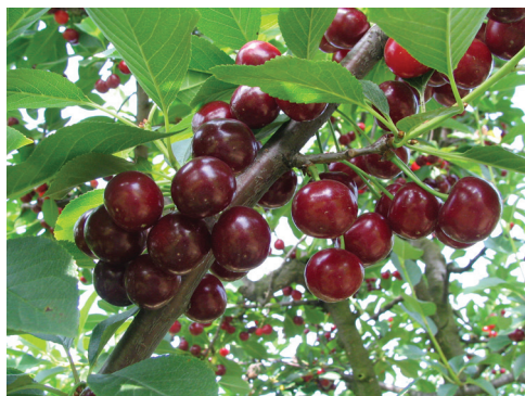
Fig. 17.2. Sour cherries (cultivar 'Oblačinska').